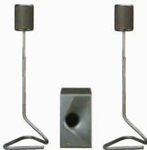
Optional Micro Satellites and Infinity Speaker Stands available from your Dealer.

Because Infinity constantly strives to improve existing products, specifications are subject to change without notice. Infinity Micro II satellites and subwoofer carry a five year transferable Parts and Labor Warranty within the United States. Consult your authorized Infinity dealer for details.